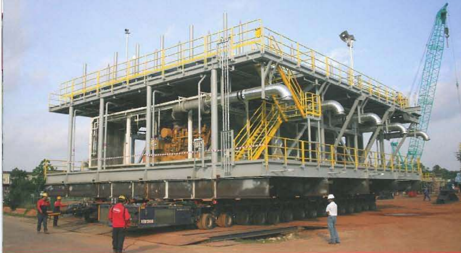
Pipe Deck Aft Module, Dim. 24.7m x 19.1m x 5.5m (413 Tons). Land transport from fabrication yard, loaded onto barge and transported by sea to Singapore.