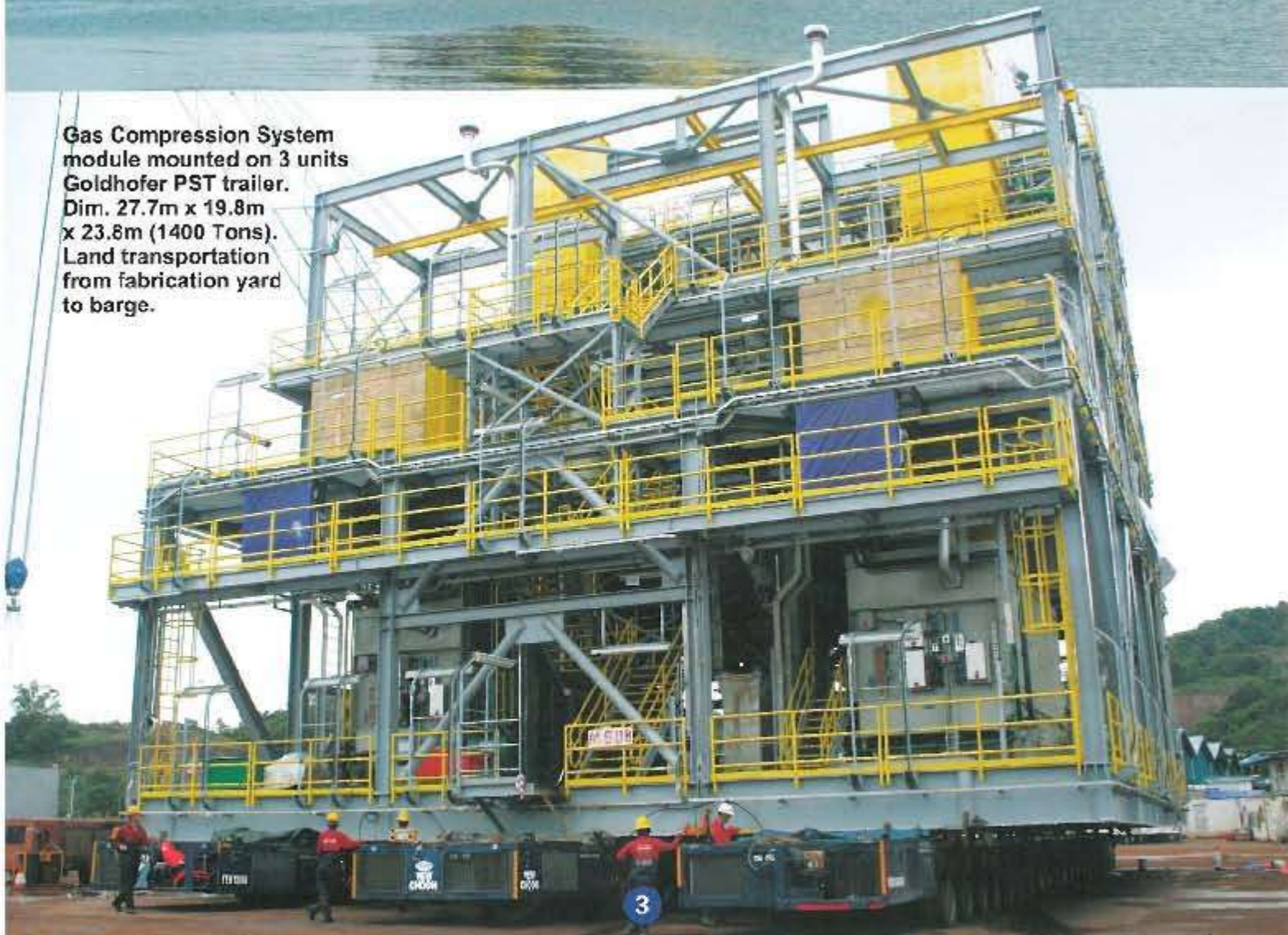
Gas Compression System module mounted on 3 units Goldhofer PST trailer. Dim. 27.7m x 19.8m x 23.8m (1400 Tons). Land transportation from fabrication yard to barge.