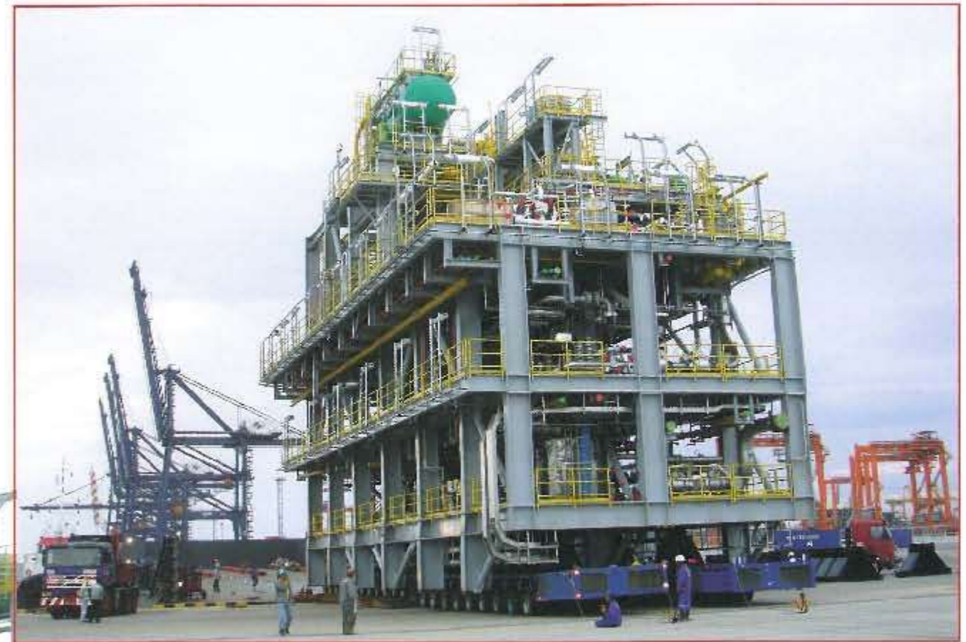
Arrival at Laem Chabang Port.