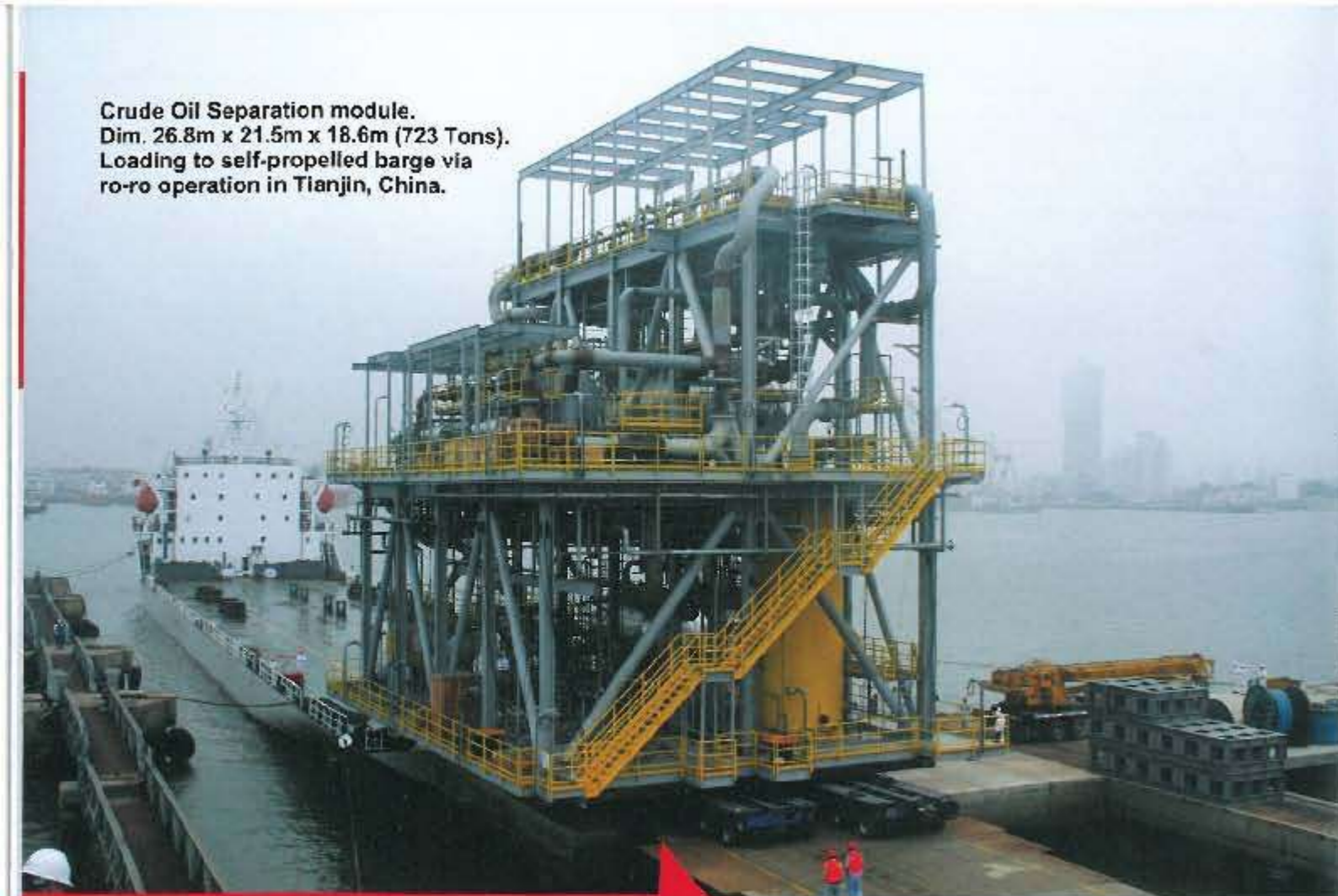
Crude Oil Separation module. Dim. 26.8m x 21.5m x 18.6m (723 Tons). Loading to self-propelled barge via ro-ro operation in Tianjin, China.