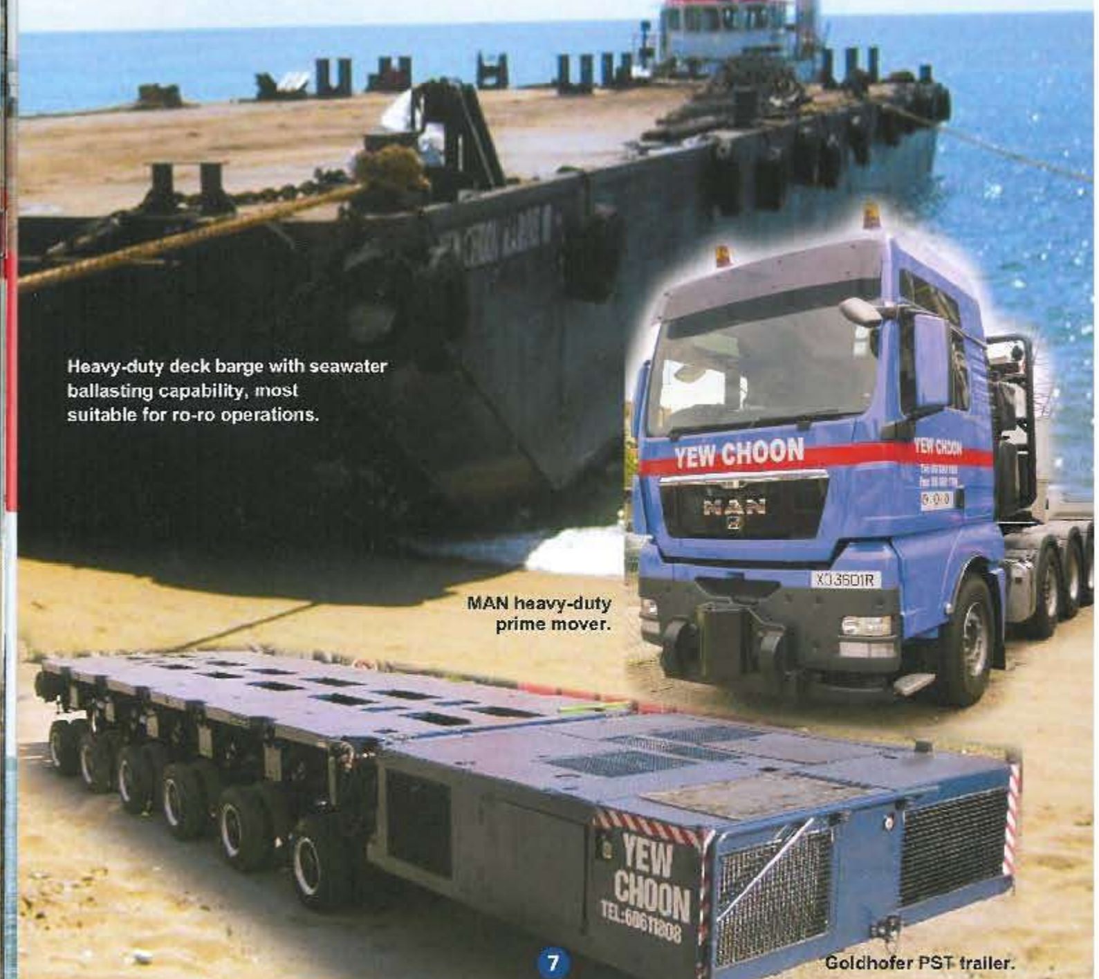
MAN heavy-duty prime mover.