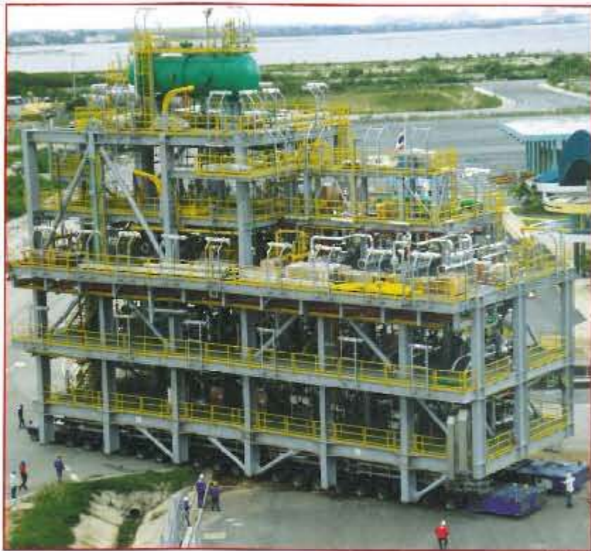
Manifold module, Dim. 34.5m x 10.1m x 21m (872 Tons). Land transport from fabrication yard to Laem Chabang Port, Thailand.