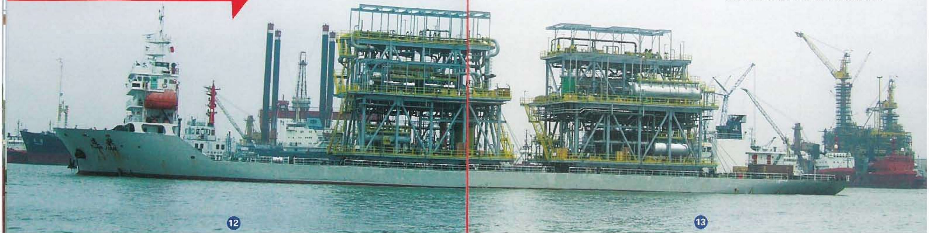
2 units module, Dim. 26.8m x 21.5m x 18.6m (723 Tons) and Dim. 24.7m x 17.5m x 22.5m (904 Tons), Sea transportation to Singapore.