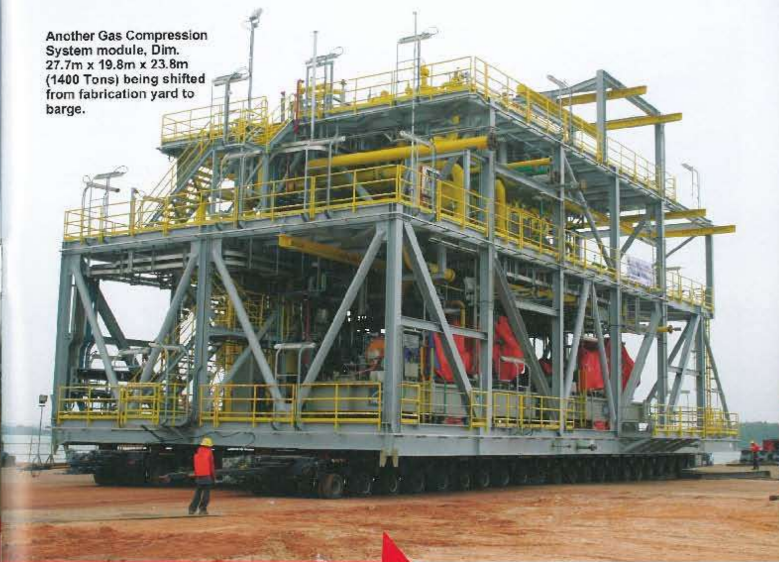
Another Gas Compression System module, Dim. 27.7m x 19.8m x 23.8m (1400 Tons) being shifted from fabrication yard to barge.