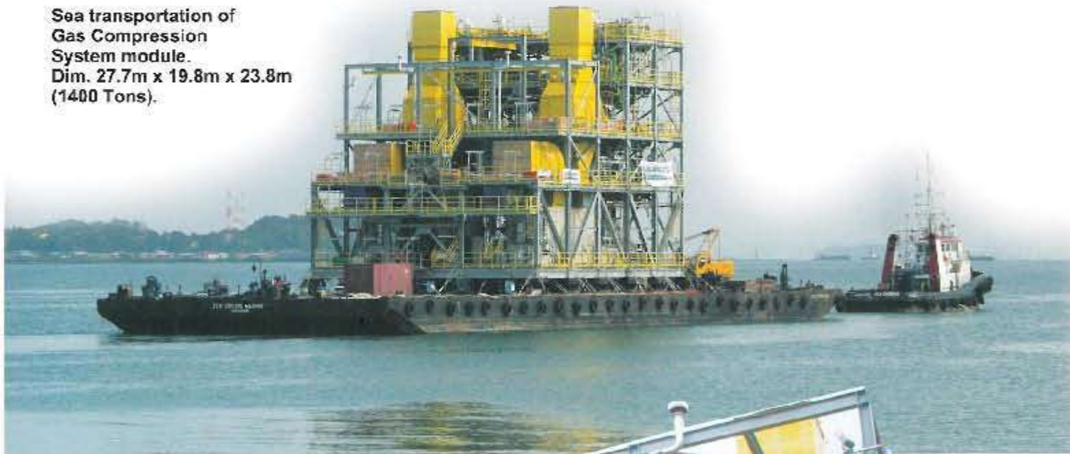
Sea transportation of Gas Compression System module. Dim. 27.7m x 19.8m x 23.8m (1400 Tons).