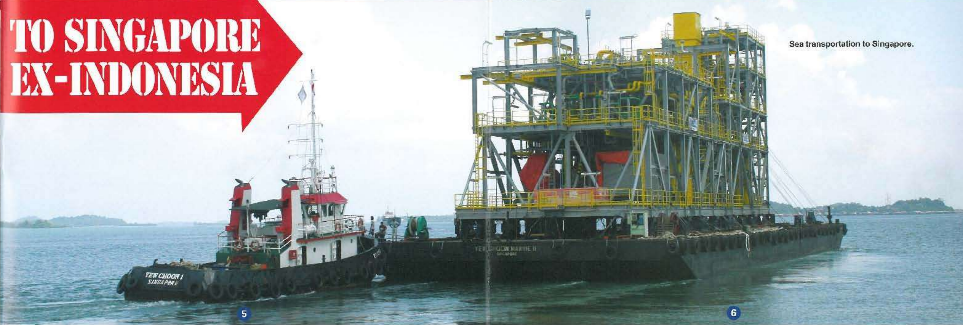
Sea transportation to Singapore.