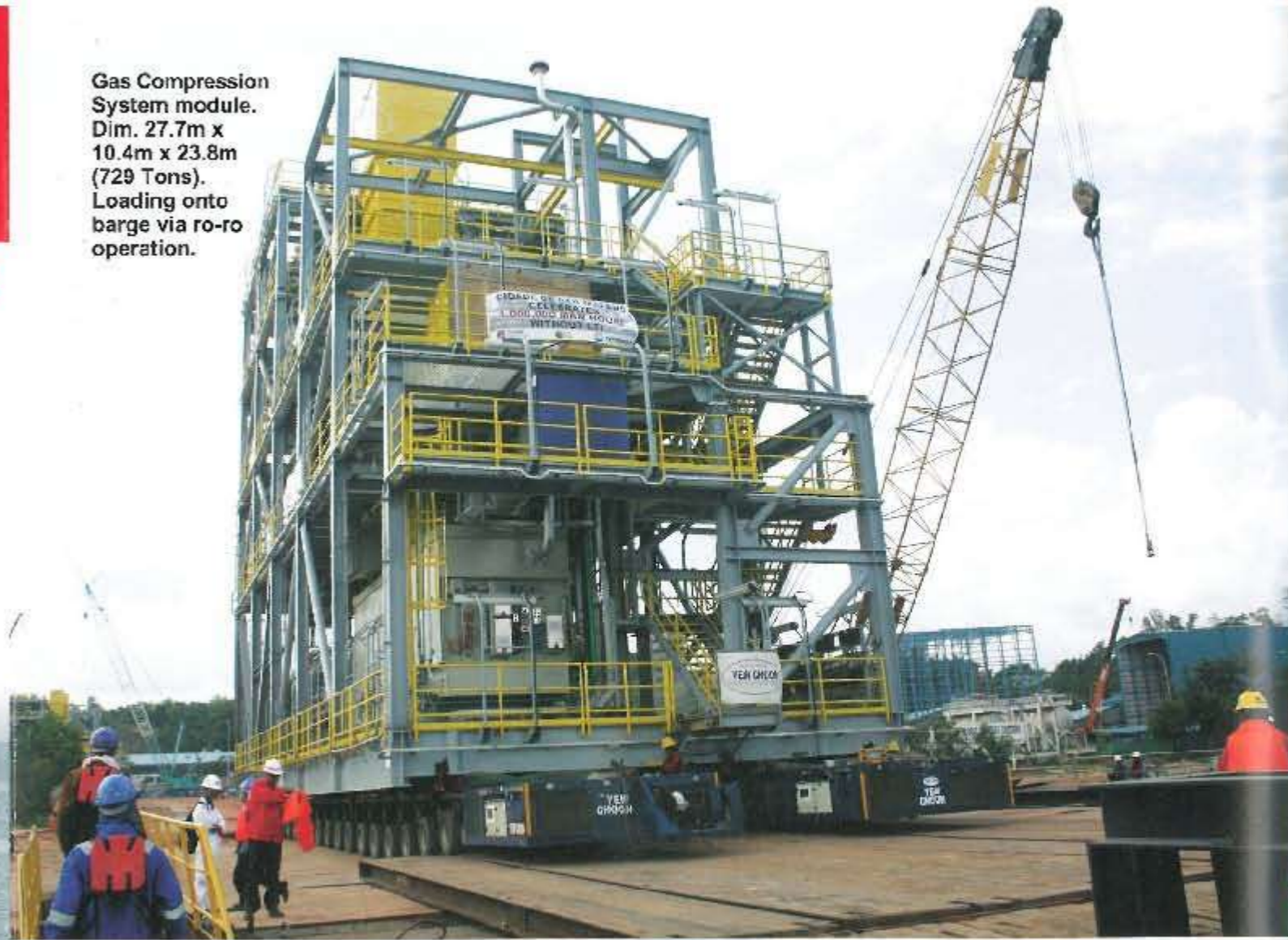
Gas Compression System module. Dim. 27.7m x 10.4m x 23.8m (729 Tons). Loading onto barge via ro-ro operation.