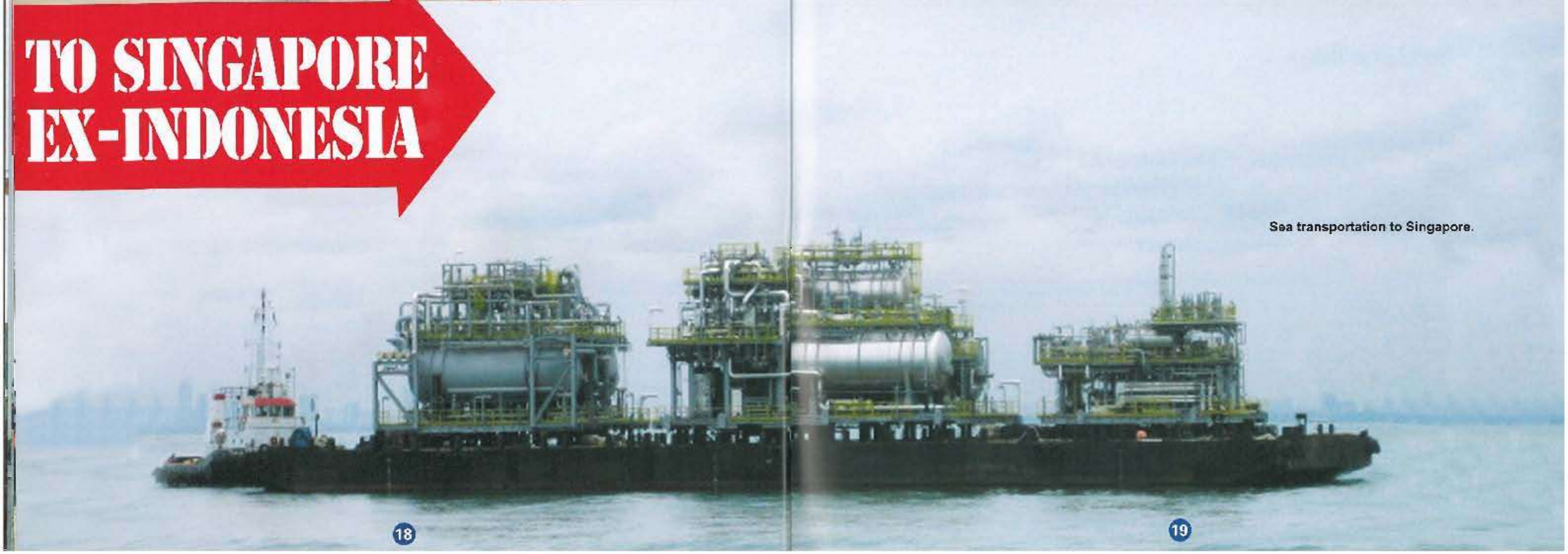
Sea transportation to Singapore.