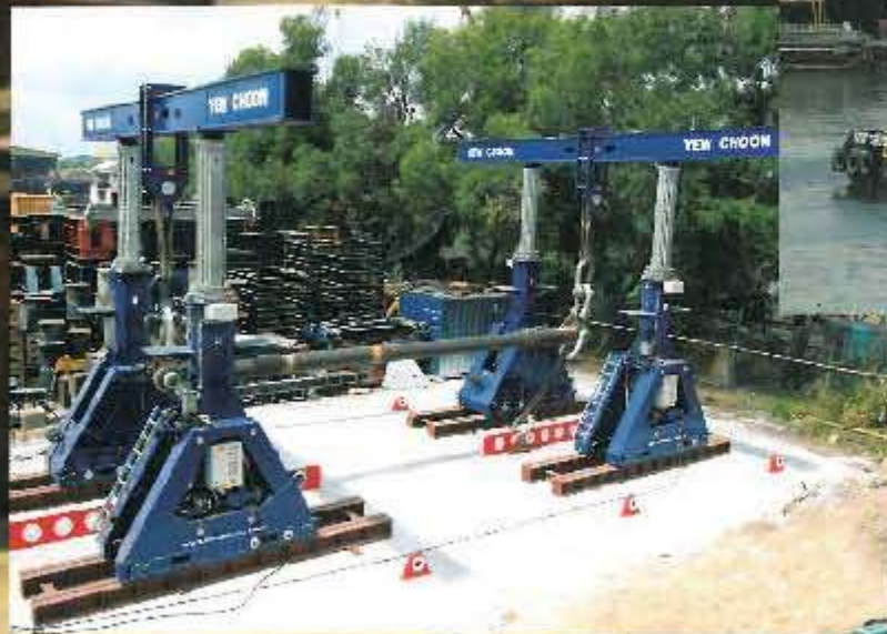
Spreader beam testing with 4-Point lift system, 1100 Tons capacity