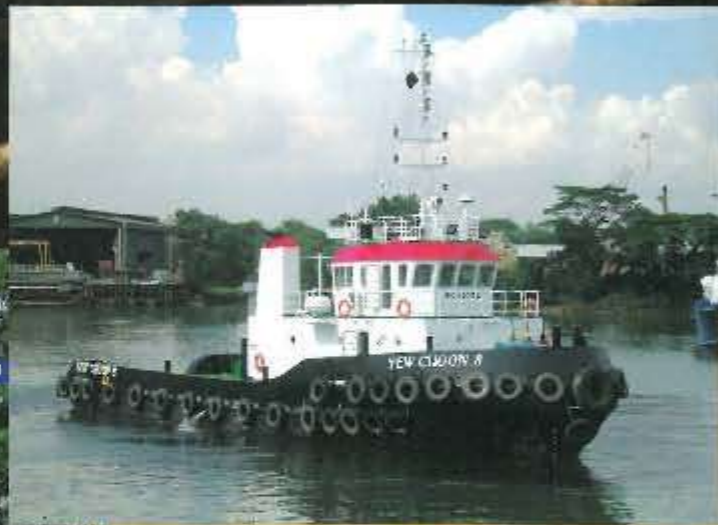
3200 BHP tug boat.