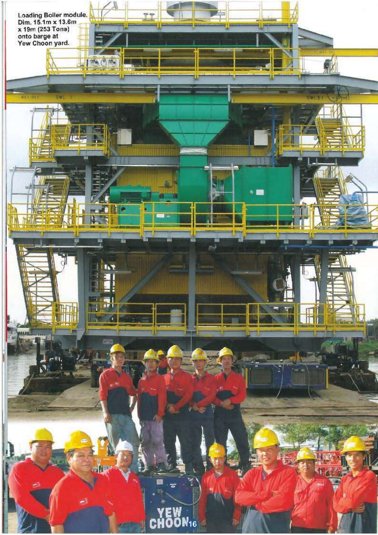
Loading Boiler module, Dim. 15.1m x 13.6m x 19m (253 Tons) onto barge at Yew Choon yard.