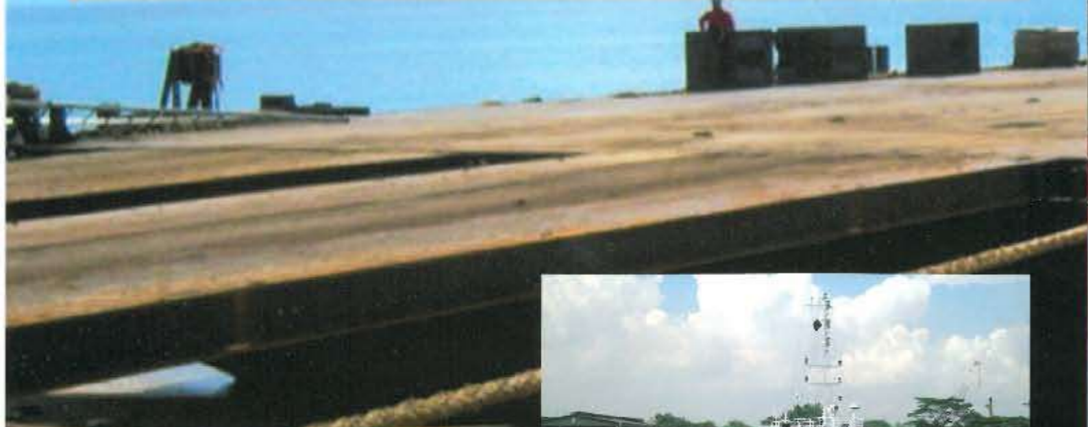
Heavy-duty deck barge with seawater ballasting capability, most suitable for ro-ro operations.