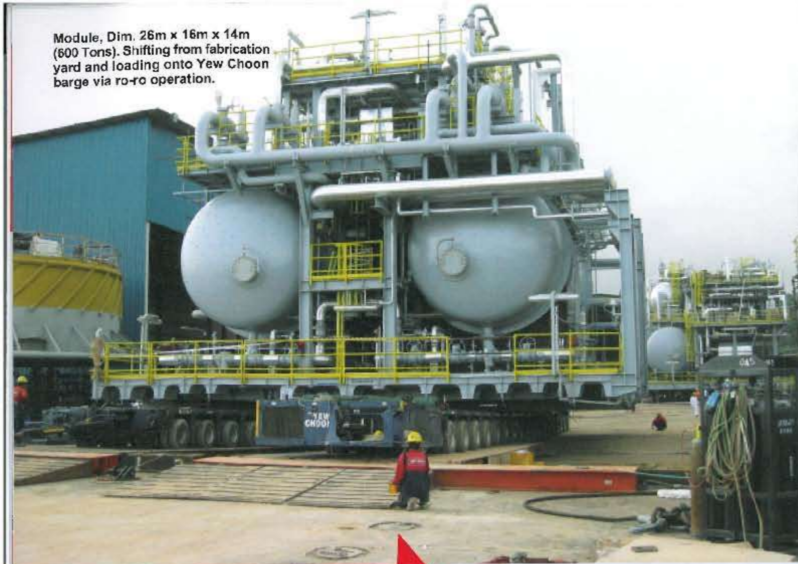
Module, Dim. 26m x 16m x 14m (600 Tons). Shifting from fabrication yard and loading onto Yew Choon barge via ro-ro operation.